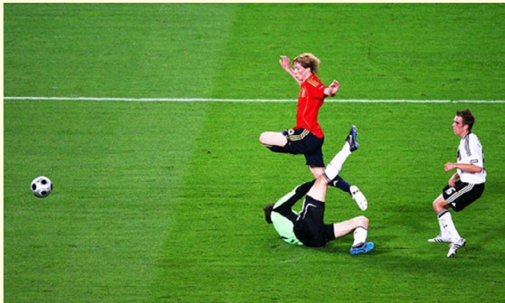
Torres takes to the wing and punctures the last line of German defence with an exquisite execution of finishing technique. The Championship winning goal.

Euro 2008 must have been among the most exciting, entertaining and successful football tournaments ever staged. It had everything: upsets, goals galore, attacking football and a worthy, if slightly surprising, winner. After 44 years of waiting, this was finally Spain's tournament. They were the better team in every match they played, beating the holders, Greece, Sweden, Italy (admittedly on penalties) and Russia (twice) on their way to the final, where they also outplayed Germany.