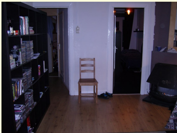
Typical Amsterdam fair-rent apartment: 60m 2 for €532 per month (all-inclusive)

There is only one situation in which your rent cannot be reduced and that is if you pay more than €630 a month ‘kale huur’ (flat rent) and you have paid that amount for more than six months. In such cases, the law considers that the protection it has offered for six months is not required. So, always start a process within the first six months of the contract. The exception to this rule is all-inclusive rents, for which you can start a process at any time.